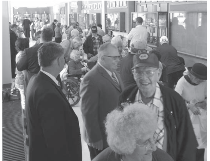
Attendees from last year's annual meeting enjoy several informational booths, which will be on hand again this year.

Annual Meeting Prize — $250 (name drawn from members in attendance) — Must be present to win