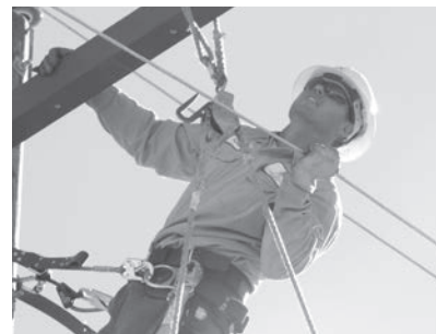
Electric lineworkers perform a variety of tasks in their job, including working on overhead lines and substations.

Scholarship recipients are selected by a committee comprised of members of the MCREA operations department. The committee's decisions are based on a number of factors, including academics, school and community participation, work experiences and a student statement of goals and aspirations. In addition to the application, candidates will be required to participate in an interview process prior to selection for the scholarship. Scholarship recipients are not required to work at Morgan County REA after graduating lineworker school. There are no age restrictions to apply for a lineworker scholarship.