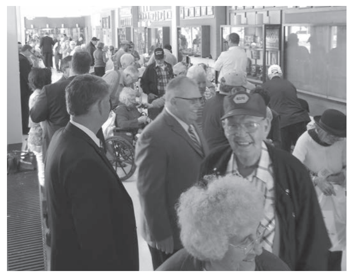
Attendees from last year's annual meeting enjoy several informational booths, which will be on hand again this year.

Annual Meeting Prize — $250 (name drawn from members in attendance) — Must be present to win